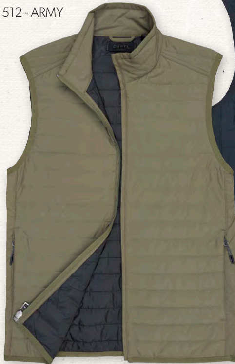
512 - ARMY

AVAILABLE IN BOTH OPEN STOCK SIZES (S-2X) & PACK OPTION (M-2X / 1-2-2-1)