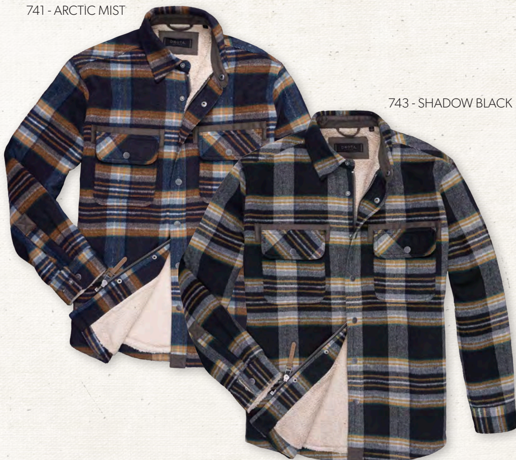
743 - SHADOW BLACK