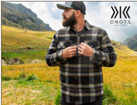
D9068 IMAGE BANNER 36" x 24"