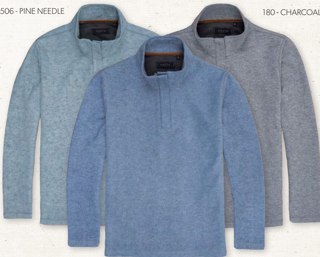
180 - CHARCOAL