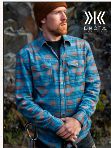
D9069 IMAGE BANNER 24" x 36"