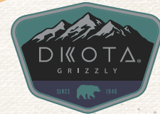
D9071 100 PK OF BRAND STICKERS 3"x 4" Vinyl Stickers