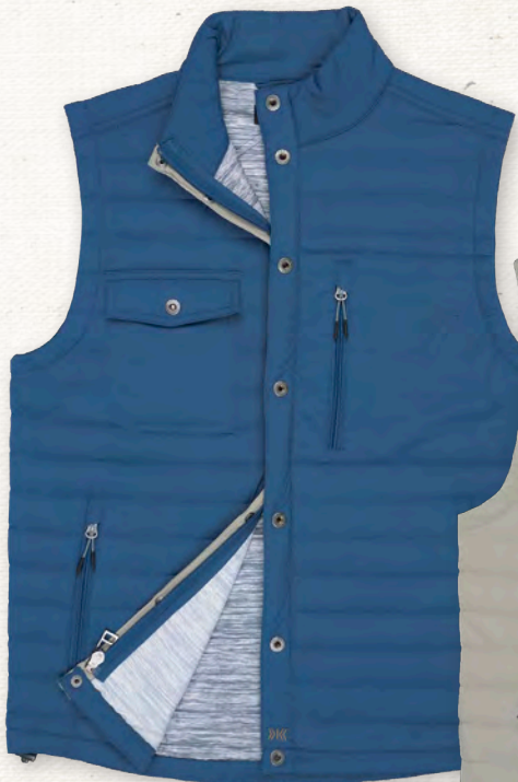
026 - DENIM RIDGE