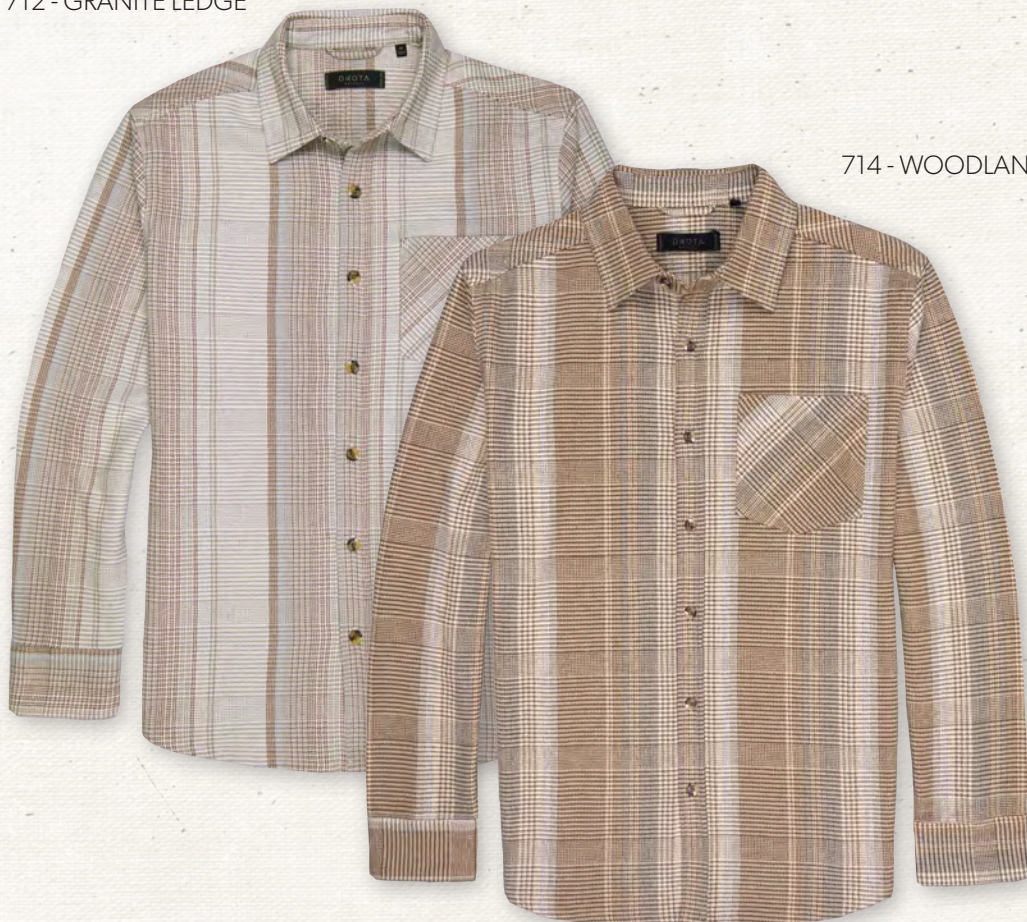
714 - WOODLAND