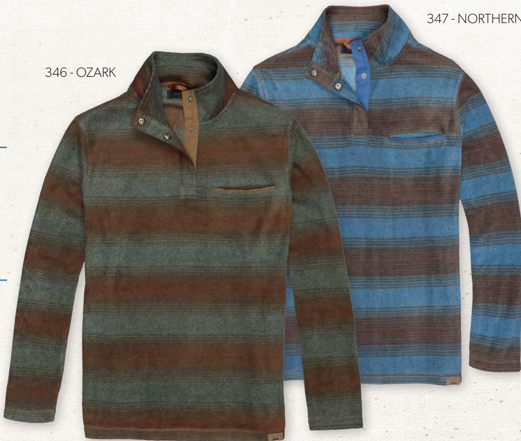
347 - NORTHERN