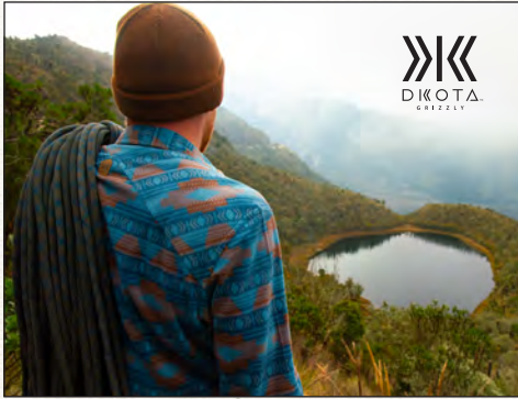
D9067 IMAGE BANNER 36" x 24"