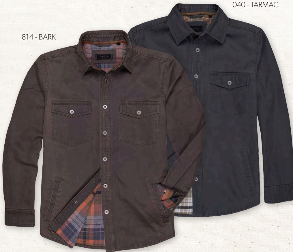
040 - TARMAC