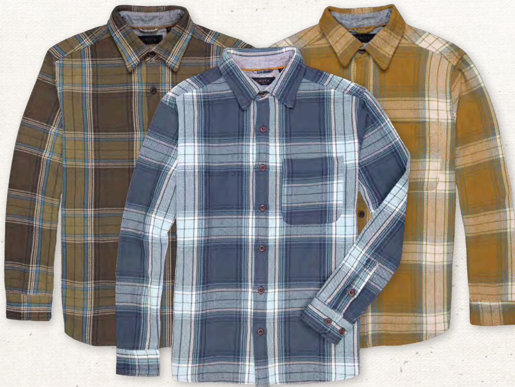
771 - TIDAL CREEK

AVAILABLE IN BOTH OPEN STOCK SIZES (S-2X) & PACK OPTION (M-2X / 1-2-2-1)