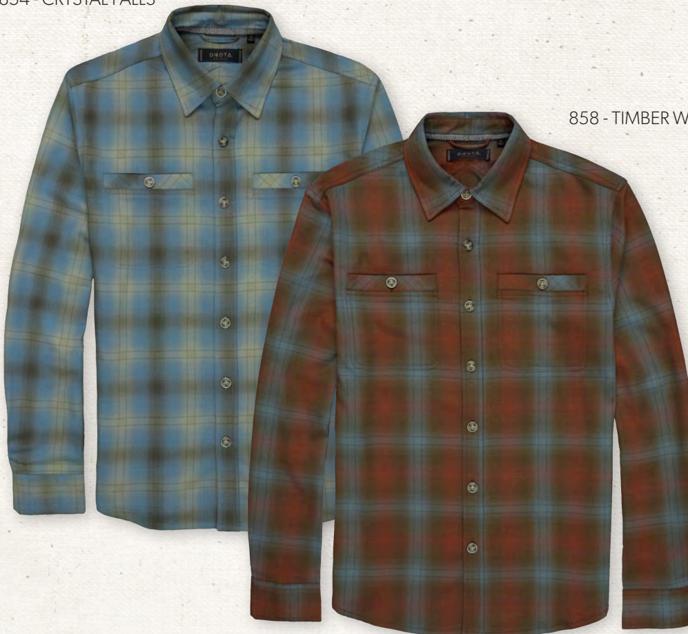
858 - TIMBER WOODS