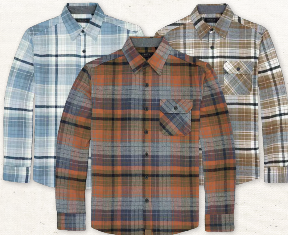
806 - WOODSMOKE