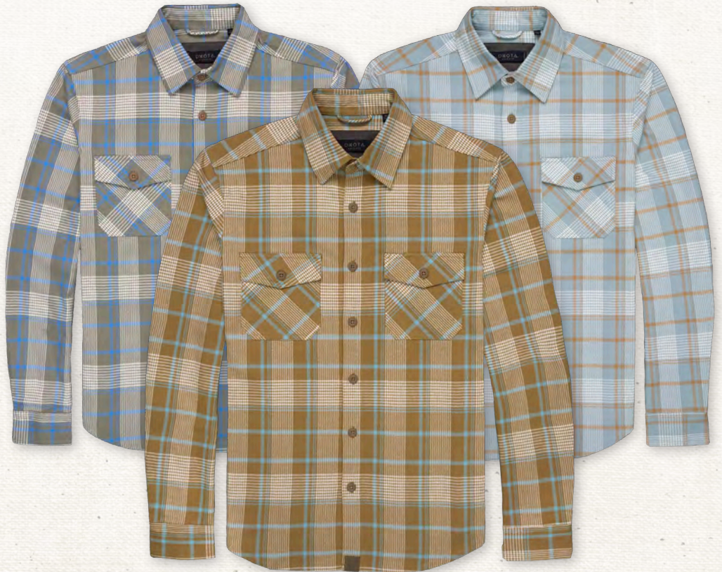
675 - GOLDEN MEADOW