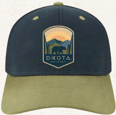
D9454 GRIZZLY SUNRISE