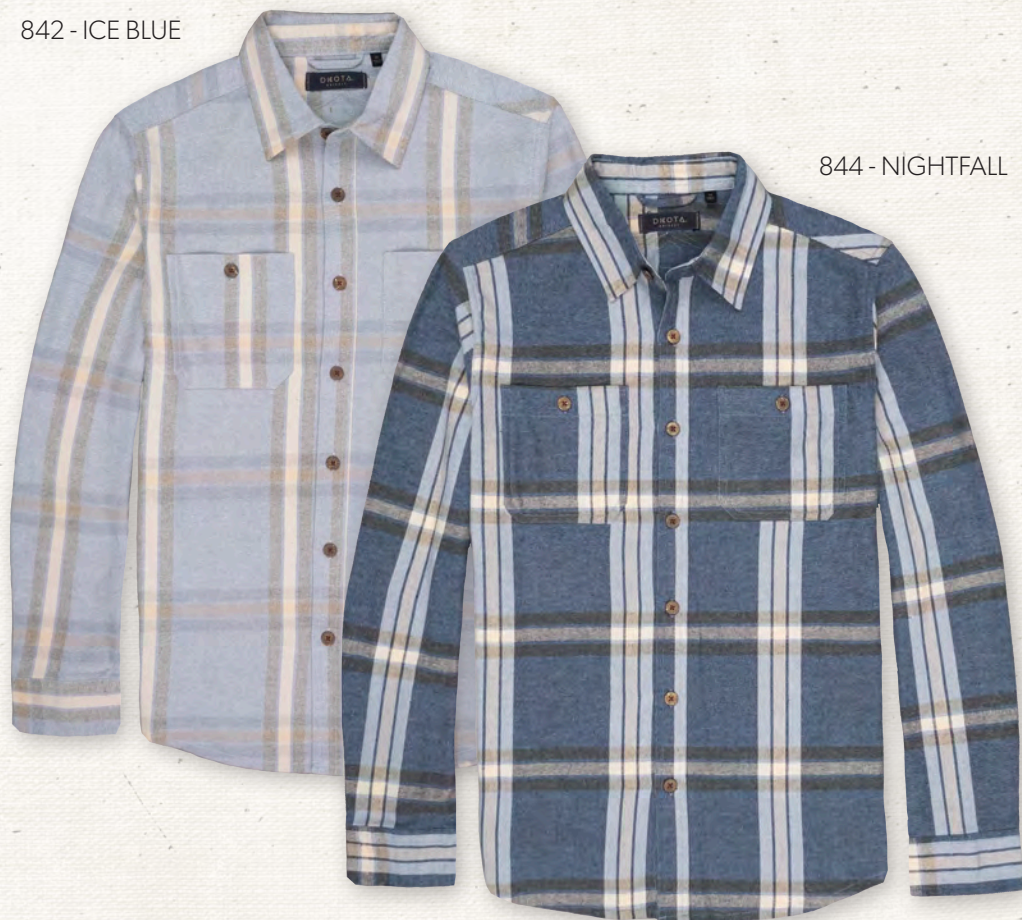
844 - NIGHTFALL