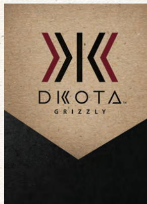
D9051 RACK SIGN 10.5" x 14" Double Sided