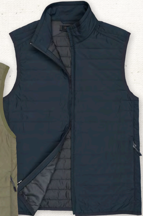
303 - ONYX