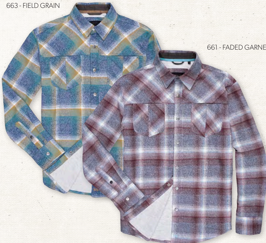
661 - FADED GARNET