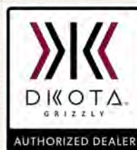
D9050 WINDOW CLING 5"x7" Clear Decal