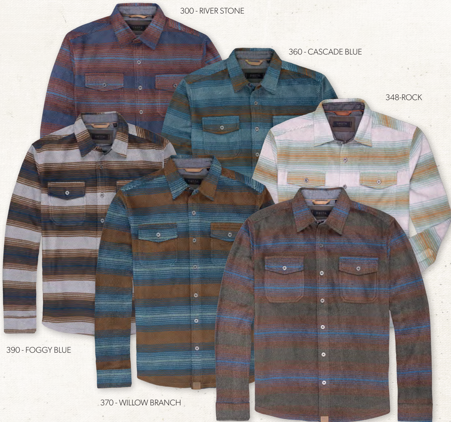
300 - RIVER STONE