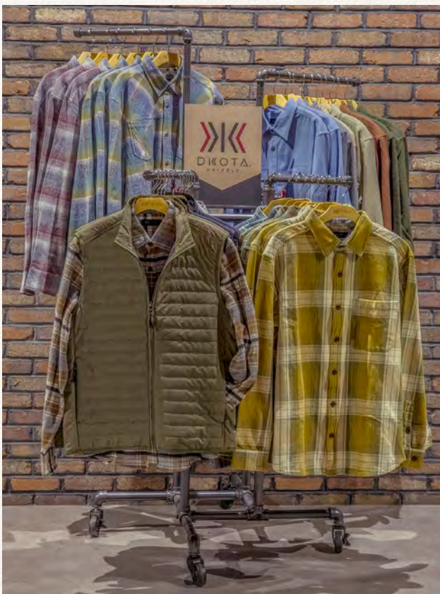
D9007 - FOUR WAY DISPLAY RACK