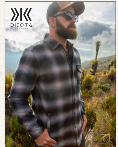
D9070 IMAGE BANNER 24" x 36"