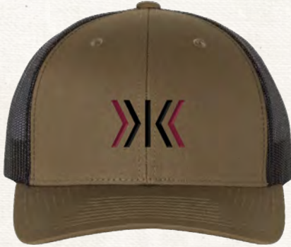
D9455 3D CHEVRON