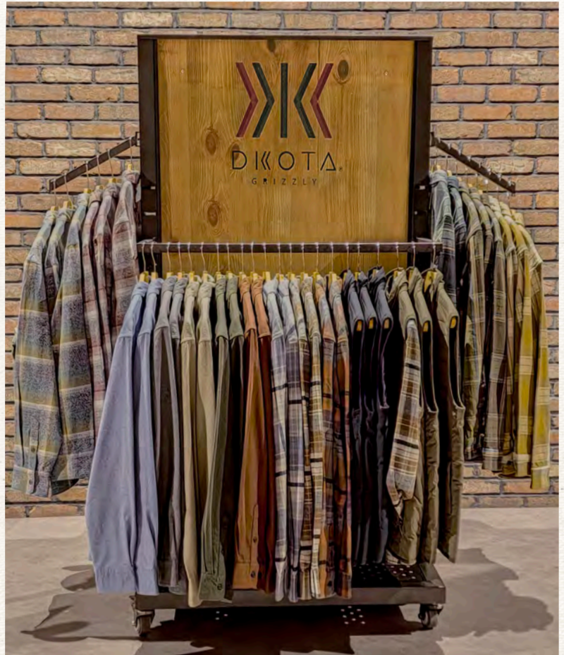
D9056 - DELUXE 4-WAY DISPLAY RACK