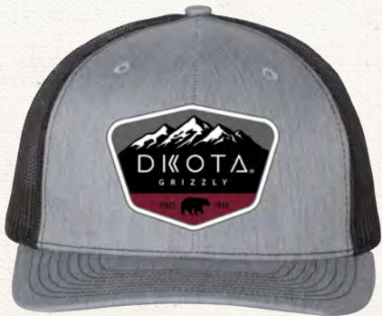
D9456 DKOTA PEAKS