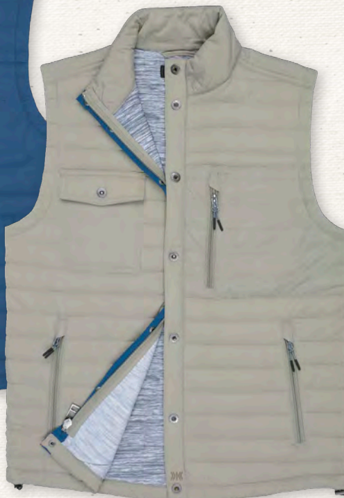
619 - SANDSTONE