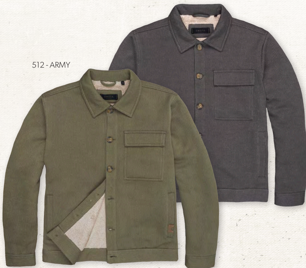
512 - ARMY