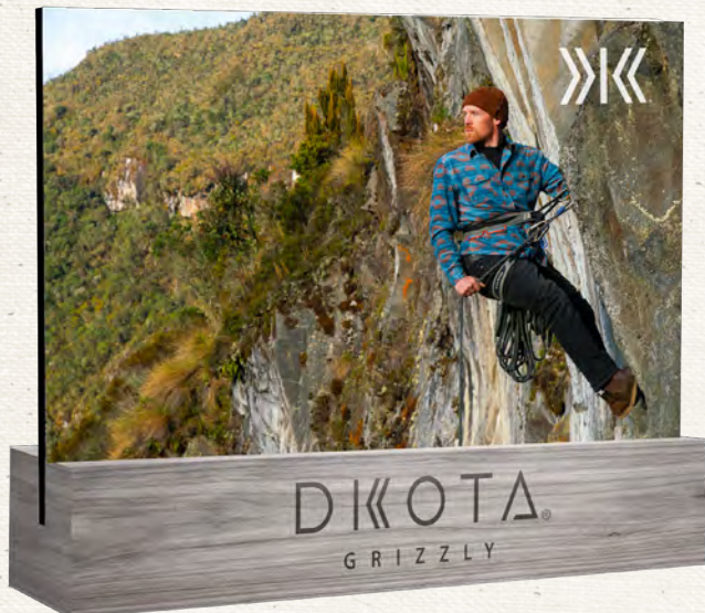
D9055 - F25 WOOD BLOCK SIGN 2"x2"x11" Wood Base 11"x8.5" Double Sided Image