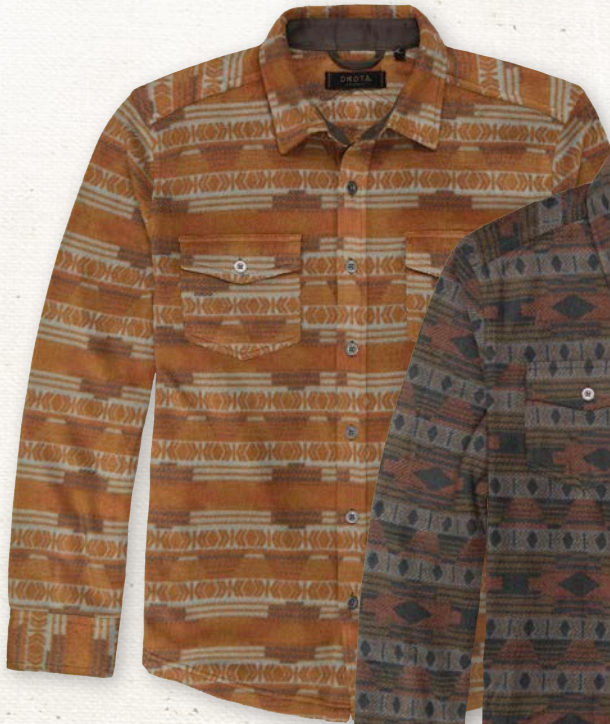
41302 - REDWOOD EARTH