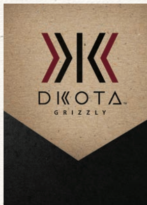
D9051 RACK SIGN 10.5" x 14" Double Sided