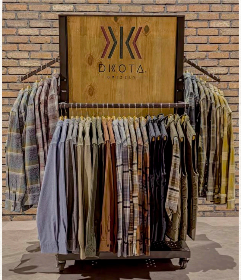
D9056 - DELUXE 4-WAY DISPLAY RACK