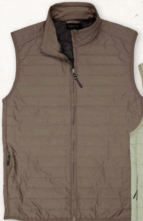
1761 - TWIG