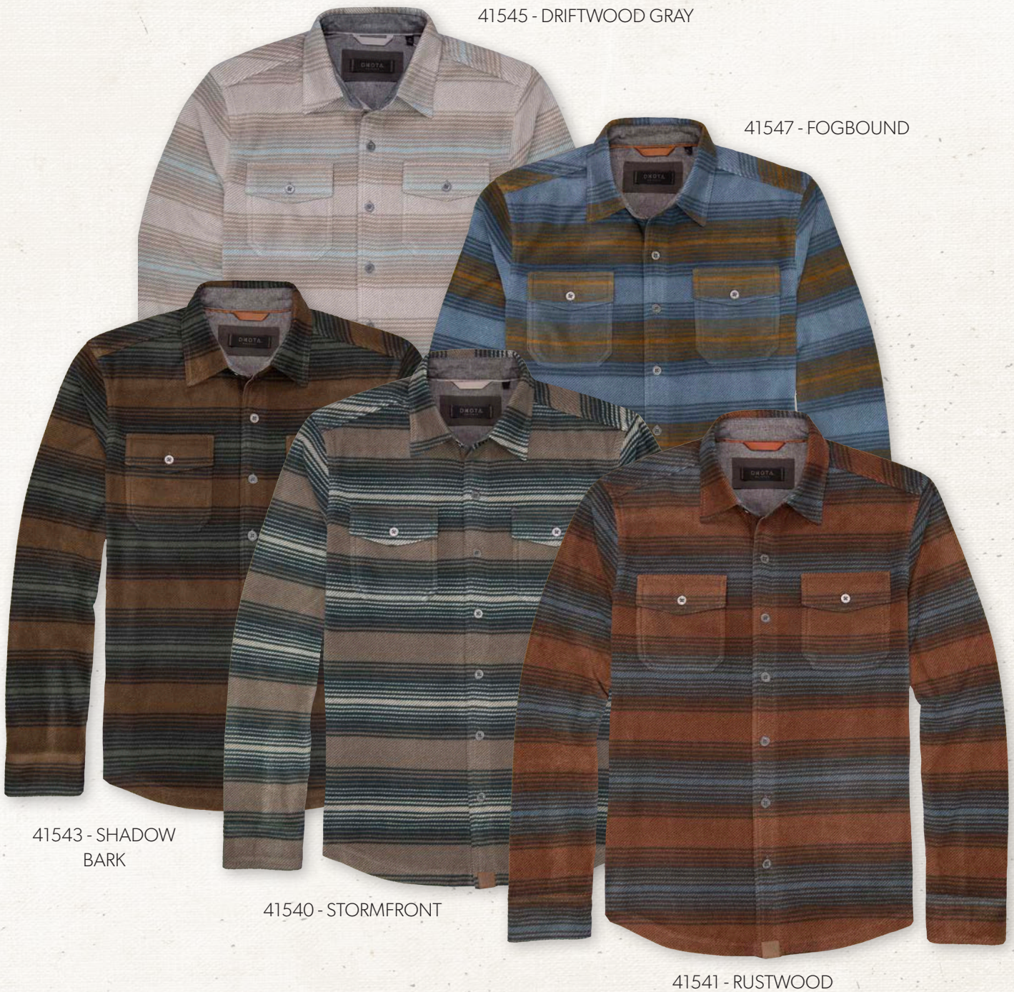
41545 - DRIFTWOOD GRAY