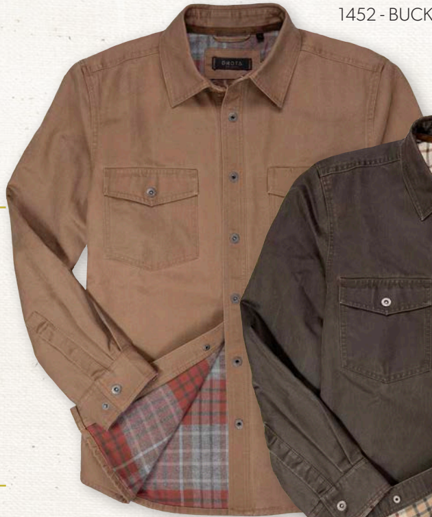
1452 - BUCK

AVAILABLE IN BOTH OPEN STOCK SIZES (S-2X) & PACK OPTION (M-2X / 1-2-2-1)