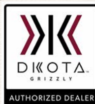
D9050 WINDOW CLING 5" x 7" Clear Decal