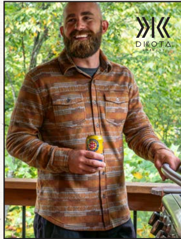
D9069 IMAGE BANNER 24" x 36"