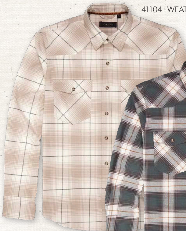
41104 - WEATHERED BIRCH