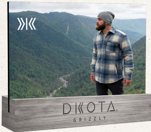
D9055 - F26 WOOD BLOCK SIGN 2" x 2" x 11" Wood Base 11" x 8.5" Double Sided Image