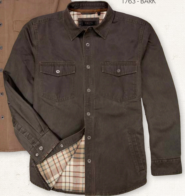
1763 - BARK