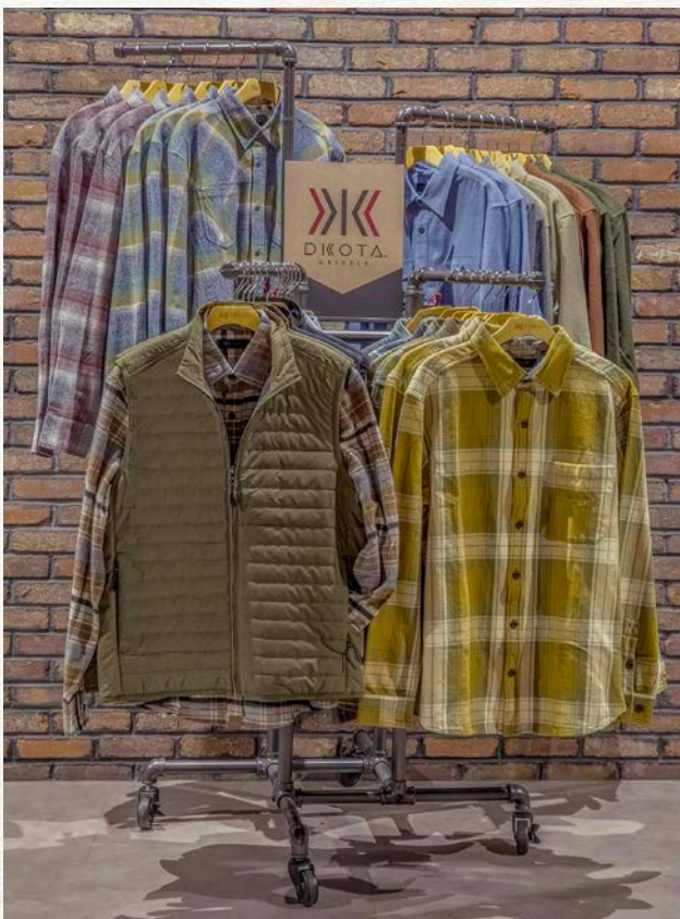
D9007 - FOUR WAY DISPLAY RACK