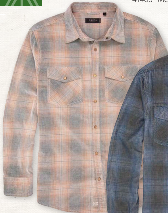
41403 - MORNING FROST