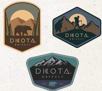
D9071 100 PK OF BRAND STICKERS 3" x 4" Vinyl Stickers