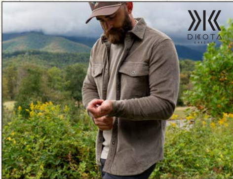
D9068 IMAGE BANNER 36" x 24"