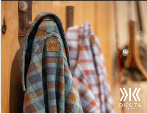
D9067 IMAGE BANNER 36" x 24"