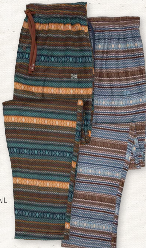
42802 - CANYON TRAIL