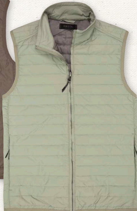
2050 - SAGEBRUSH