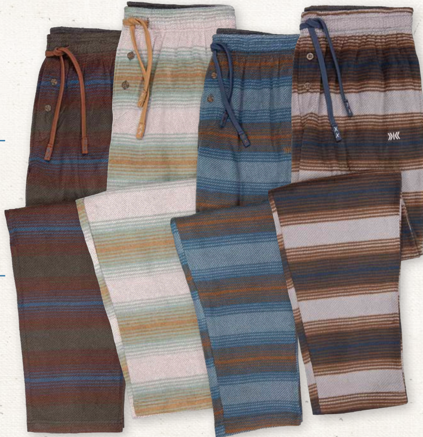
41535 - ACORN SHELL