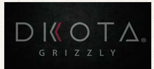
D9054 METAL BRAND SIGN 17" x 8" Single Sided

*PRE-BOOK DEADLINES APPLY FOR FALL DELIVERY. SEE YOUR REP FOR DETAILS. ALL DESIGNS SHOWN HERE ARE SUBJECT TO CHANGE.