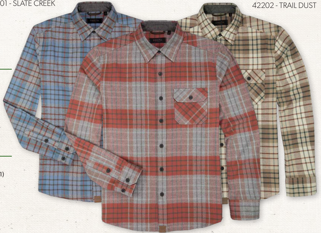
42203 - MAPLE FORGE

AVAILABLE IN BOTH OPEN STOCK SIZES (S-2X) & PACK OPTION (M-2X / 1-2-2-1)